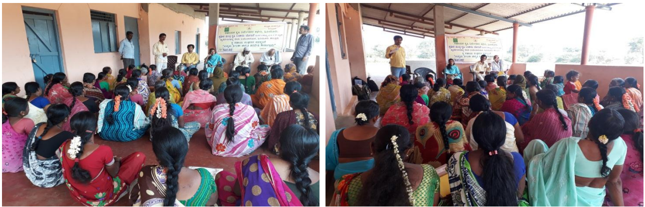
BioFuel Training to SHG members in Vedha Right & Left Nala watershed of Hiriyur Taluk