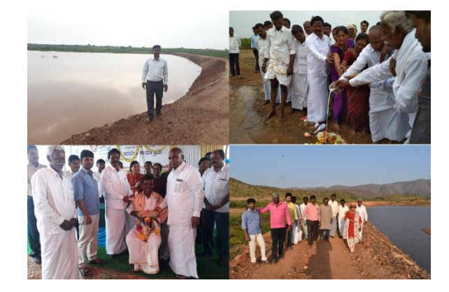
increased the structure value.

Taluk MLA, elected members, officers from line department &Panchayat Raj were invited for "Ganga Pooja" ceremony visited the site & appreciated VWC, PFA & NABARD. And some officials assured to provide first preference to these villages for their departmental schemes. DCFo, Department of Social Forestry has included Biofuel Block Plantation across the Nala in this year action plan. Recently Fishery Department had dumped 16000 fish(fry) in Nalabund. IMPACT: Water for more than 1.5 lakh livestock throughout this year.