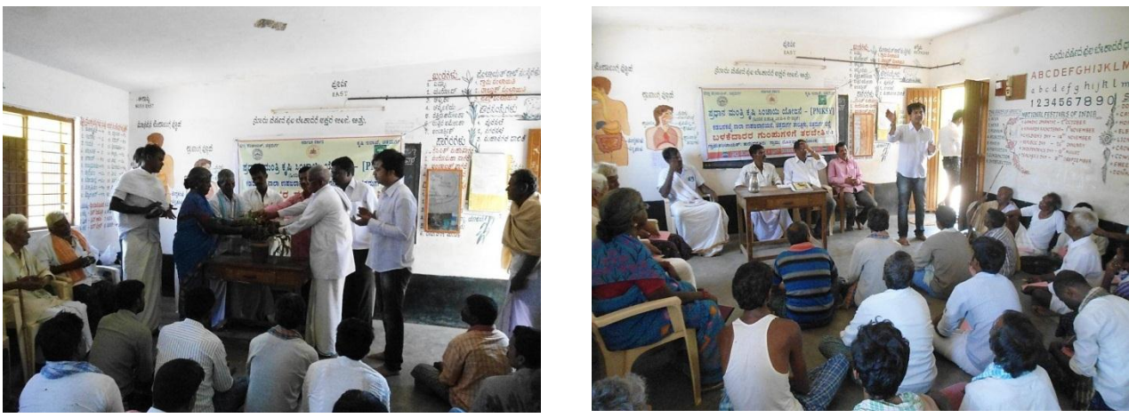
BioFuel Training in Kadabanakatte watershed Chitradurga Taluk