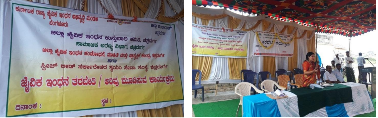
BioFuel Training to VWC members of NABARD Nagathalli watershed of Hosadurga Taluk