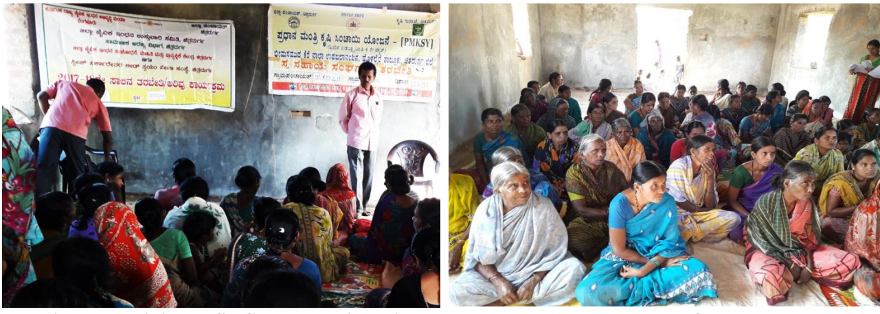
BioFuel Training to SHG members in Bhimsamudra Kere Nala watershed of Holalkere Taluk