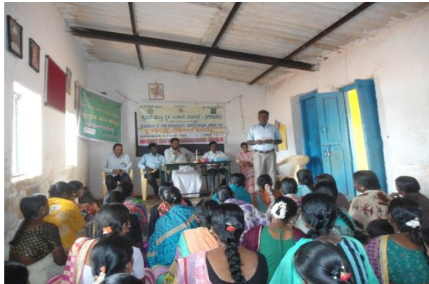
Hosadurga Taluk PMKSY Batch 5th