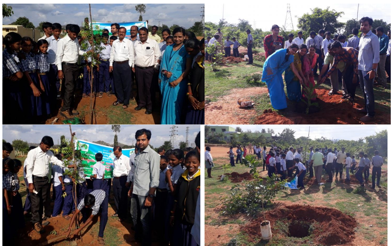
International BioFuel Day Celebration by Planting BioFuel Plantation in School Premises. School Childrens, DFO Social Forestry, Project Co-ordinator I & D Center were also involved in planting.