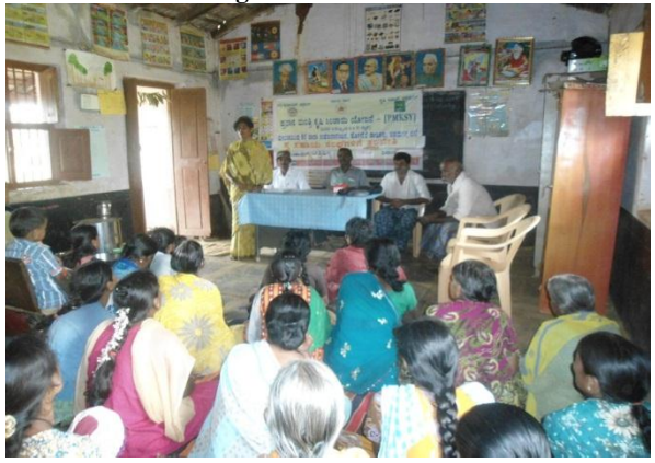
Hosadurga Taluk PMKSY Batch 6th