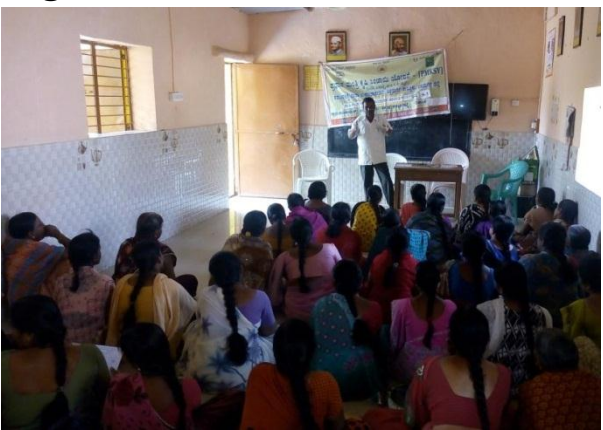
ChitrdaurgaTaluk PMKSY Batch 6th