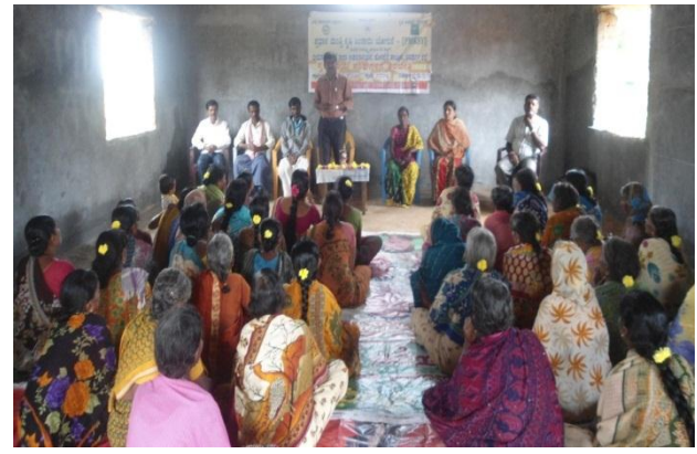
Holallkere TalukPMKSY Batch 6th